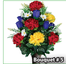
Purple Roses with Red and Yellow Mums