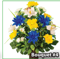
Blue and Yellow Orchid Mix