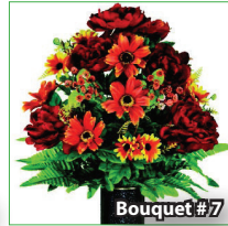
Orange Lily and Burgundy Dahlia