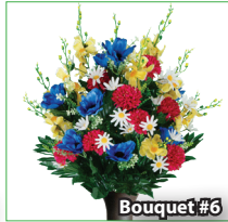
Blue Anemone Garden Mix Bouquet