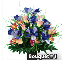
Cream and Pink Tulips w/Purple Iris