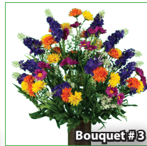
Purple Violet Yellow Wildflower Mix