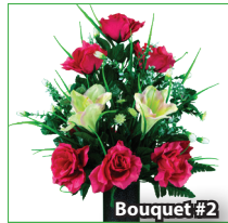
Fuchsia Roses and Amaryllis